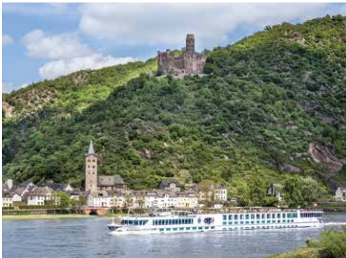
Uniworld's River Empress along Europe's Rhine River.

GO: All-inclusive, nine-day sailings from Basel to Amsterdam (or reverse) aboard the 130-passenger River Empress include transfers, onboard meals, guided shore excursions, and more. Departures: Multiple dates, March 14 through November 5, 2018; from $2,199.